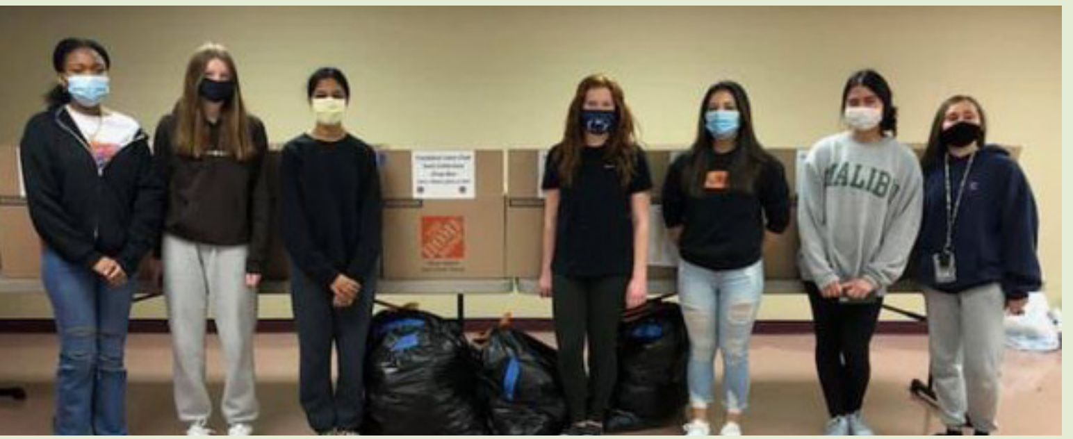
A big thanks to the Lincoln-Way East Key Club for collecting socks for people in need. In collaboration with the Lions Club and Kiwanis, 330 pairs of socks were collected.

If you or someone you know is experiencing food hardship please contact Frankfort Township at (815)469-4907.