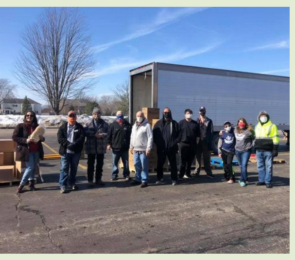
Thank you to all of our volunteers that have made our drive through food distribution events successful. Families receive boxes of dairy, produce, and meat at our pop-up pantries